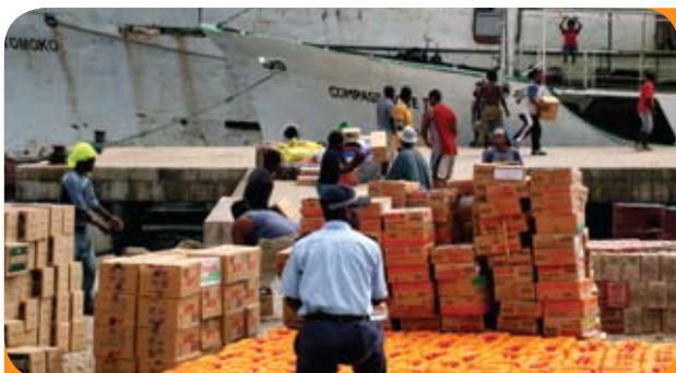
Unloading food aid at Gizo, Solomon Islands