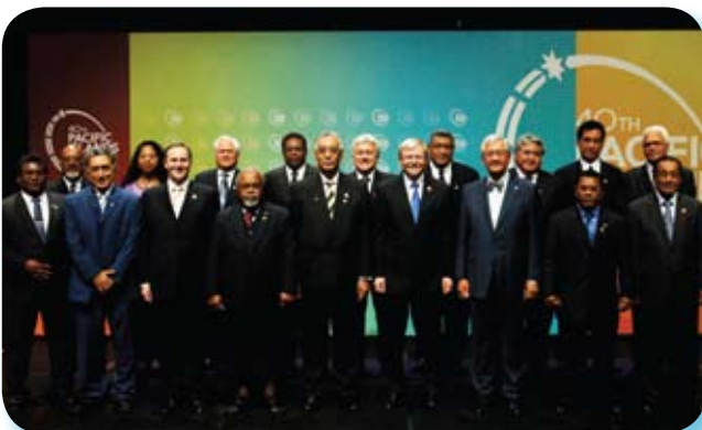
Forum leaders, Cairns, 2009