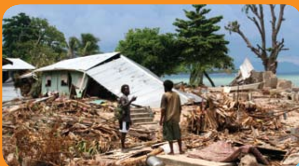
Tsunami destruction, Gizo, Solomon Islands