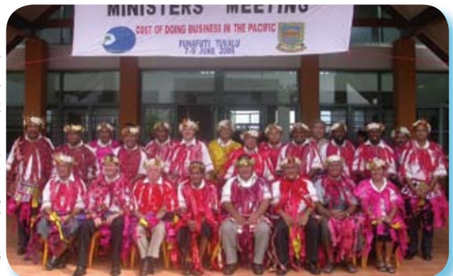
Forum economic ministers, Tuvalu, 2005