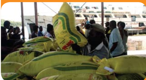
Rice being unloaded at Gizo, Solomon Islands